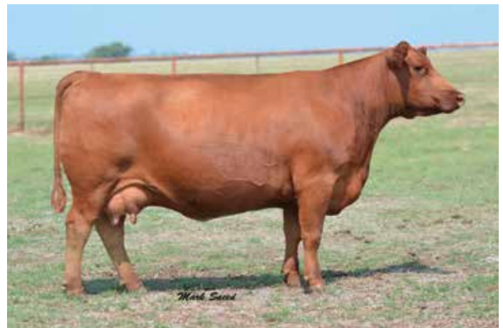
A-1 Siera Indeed 549X - Dam of Lot 87

SYR Bingo 9185G is an own son of the great A-1 Siera Indeed 549X. He is sired by the $60,000 Red Blairs Bingo 581B. He is a big bodied, stout made bull that offers a superior cow family and strong maternal foundation. EPD's rank 9185G among the top 25% DMI, top 36% Milk, top 4% ME, top 30% YG, and top 14% Fat. OS Carrier.