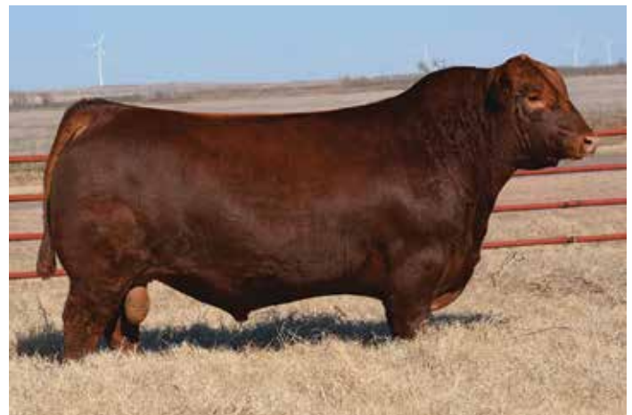
Red Blairs Bingo 581B - Sire of Lot 87

9124G comes from the influence of the legendary Andras Fusion R236 via his sire, Smoky Y Fusion 7148E. The dam of 9124G is a productive two-year old female with superior udder quality. His moderate birth weight combined with his double digit CED and negative BW EPD is what makes him a logical option for use on heifers. EPD's rank 9124G among the top 30% GridMaster, top 30% BW, top 36% DMI, top 22% ME, top 28% CEM, and top 16% Marb.