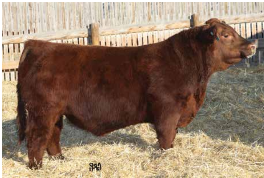
Red U-2 Reckoning 149A Sire of Lot 45 and Paternal Grandsire of Lots 40 - 44