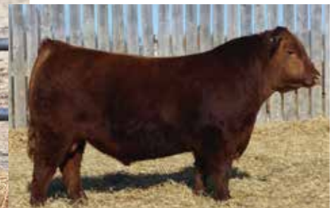
Red Cockburn Assassin 624D Sire of Lots 72 & 73

9155G is backed by an Aces Wild cow that always brings a heavy weaning calf to the weaning pen. He boasts an IMF Ratio of 110. He is also the number 1 yearling weight bull of his contemporary group with over 1400 pounds at 365 days. He charts a 114 YW Ratio. EPD's rank 9155G among the top 27% GridMaster, top 36% WW, top 26% YW, top 17% ADG, top 24% DMI, top 11% Milk, top 5% ME, top 21% CW, and top 26% Fat. Performance pays!