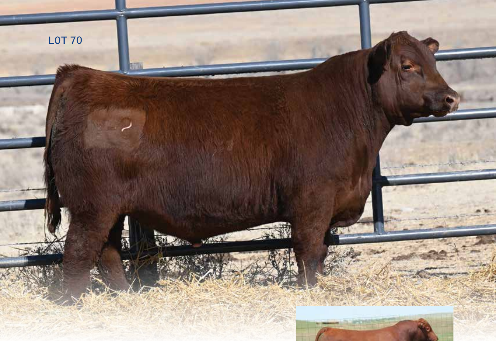
Crump Powder River 7787 - Sire of Lots 70 & 71