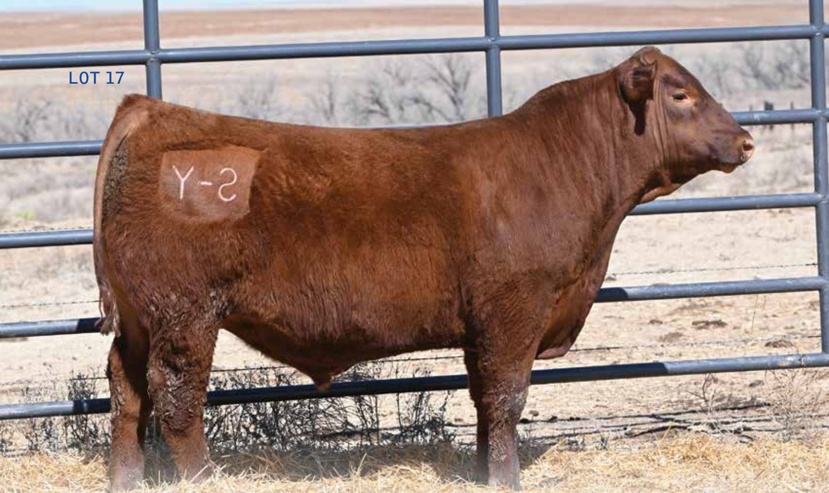
Red Wilbar Cora 443P Maternal Granddam of Lots 17 & 18