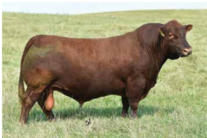
Bieber Rollin Deep Y118- Paternal Grandsire of Lots 126 - 127

9304G is sired by the Andras Fusion R236 son, Smoky Y Fusion 7148E. Her dam is a PIE Right Kind 3120 daughter from the Erica cow family. EPD's rank her top 35% BW, top 18% DMI, top 16% ME, top 34% CEM, and top 32% Marb.