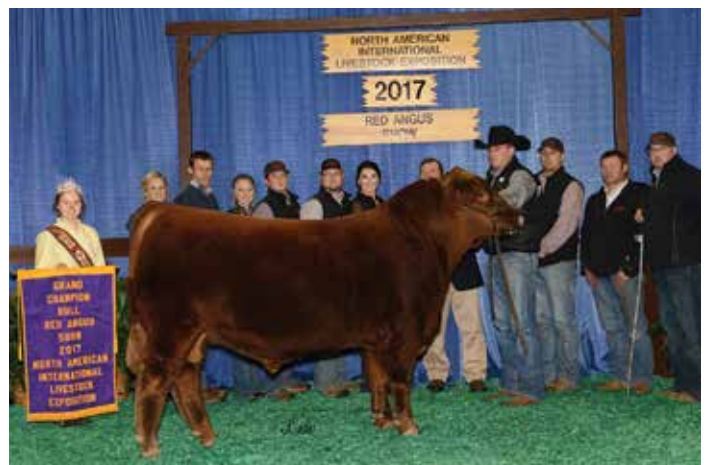
TC Return Policy 42D - Sire of Lots 81 - 84