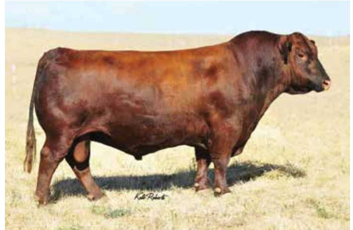
Andras Fusion R236 - Paternal Grandsire of Lot 86

Smoky Y Bruno 9128G combines the influence of two of the most influential sires to ever walk to the pastures of the S-Y. 9128G is sired by Smoky Y Who Dat 7221, the powerhouse son of PZC TMAS Red Sky 2794. His dam is a top daughter from the RED SSS Traverse 387Z sire group. EPD's rank 9128G among the top 20% DMI, top 15% Milk, top 8% ME, top 11% YG, and top 21% Fat. A product of the program!