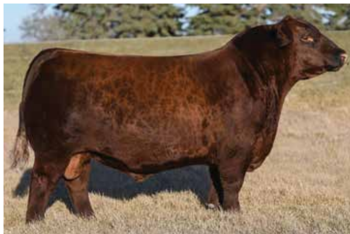
KJHT Power Take Off - Sire of Lots 16 - 20