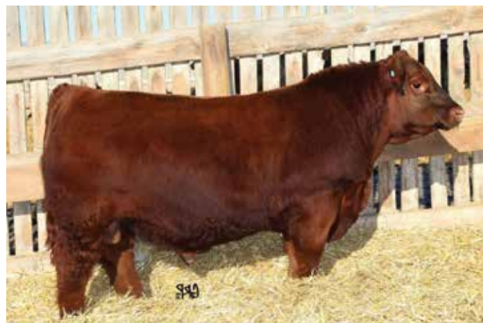
Red U-2 Renown 193C - Sire of Lots 40 - 44