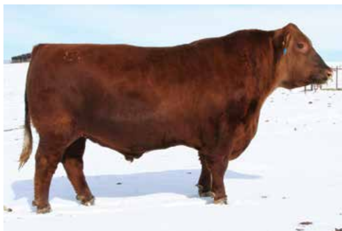
Brown Commitment S7206 - Sire of Lots 67 - 69

Smoky Y Commitment 9104G is sired by Brown Commitment S7206 and backed by a productive first calf heifer that is sired by Red Lazy MC CC Detour 2W. His actual birth weight of 71-pounds makes him an option for use on well-managed heifers. EPD's rank him among the top 30% GridMaster, top 34% DMI, top 9% ME, top 24% Stay, and top 6% Marb. 9104G is a good looking, smooth shouldered, shapely herd sire prospect by the marbling trait leader for over a decade, Commitment S7206.