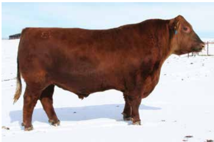
Brown Commitment S7206 - Sire of Lots 113 - 115