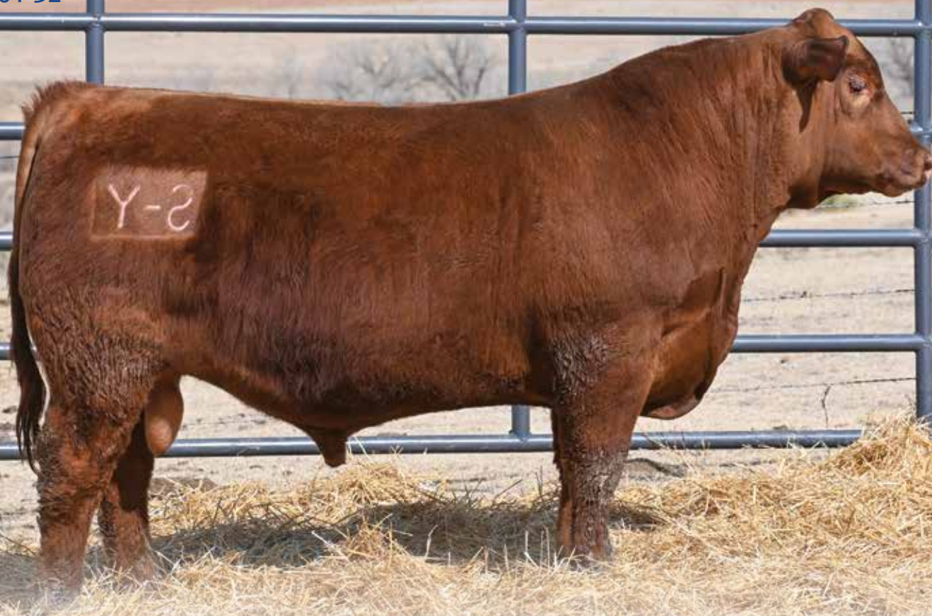
PIE One of a Kind 352 Sire of Lots 32 - 34