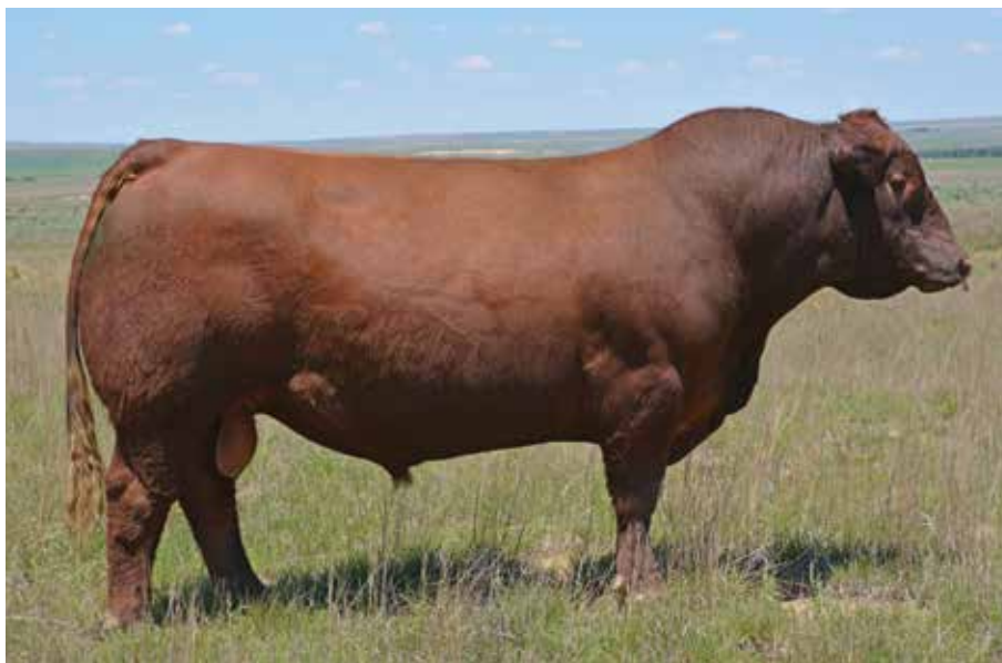
PZC TMAS Red Sky 2794 - Sire of Lots 109 - 112