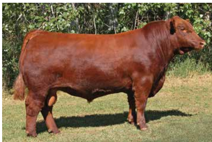
Red Lazy MC CC Detour 2W - Paternal Grand sire of Lots 74 - 78