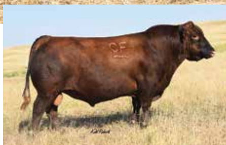
Feddes Oscar X28 - Sire of Lots 49 - 51