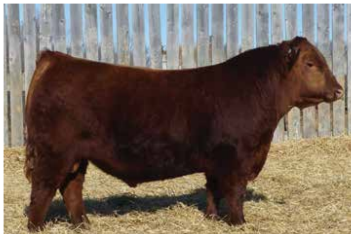
Red Cockburn Assassin 624D - Sire of Lot 108

Body, shape, structural integrity... Smoky Y Emuly 1921G fits the bill and personifies the practicality and fundamentals that we strong enforce within our cow herd. There is no denying the amount of look, balance, and eye-appeal that this striking Red Cockburn Assassin 624D daughter offers. Once again, a Traverse daughter is behind the scenes. There is no question that the Traverse daughters are as functional and productive as any group of females on the ranch. 1921G ranks top 26% GridMaster, top 4% WW, top 15% YW, top 20% ADG, top 20% Milk, top 5% ME, top 15% CW, and top 24% Fat. A true sale feature that is straight from the heart of our replacement pen!