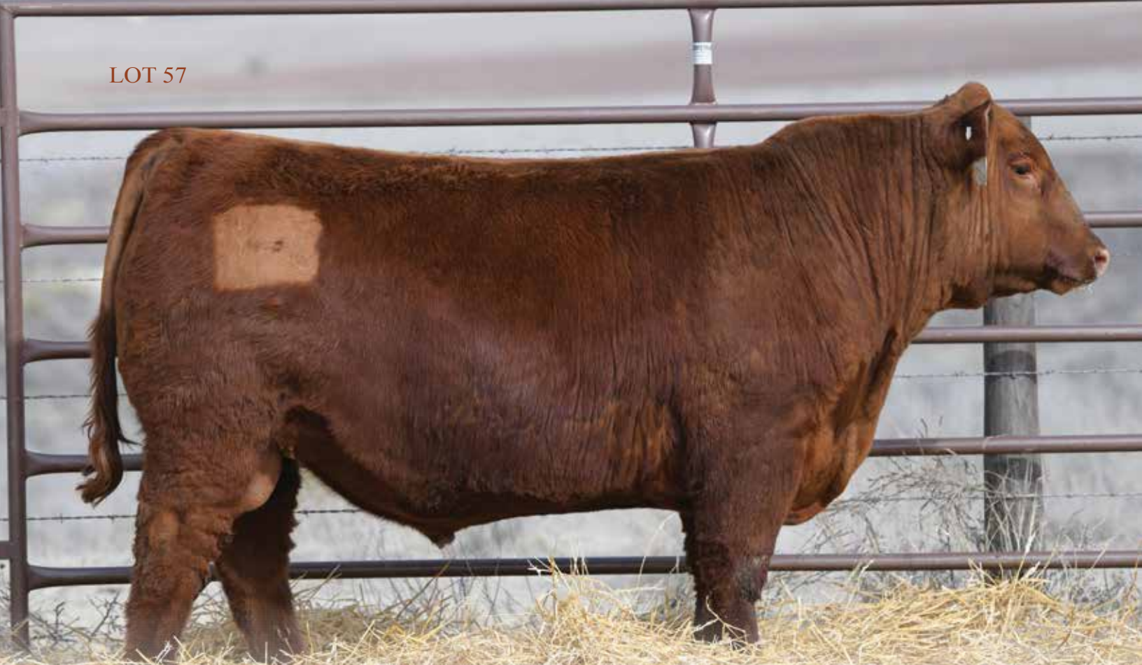
Red Lazy MC Detour 2W - Sire of Lots 57 - 58