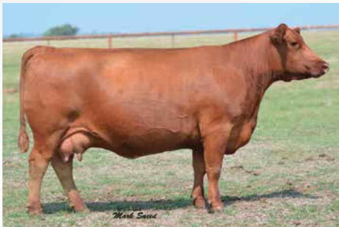
A-1 Sierra Indeed 549X - Dam of Lots 1 -3