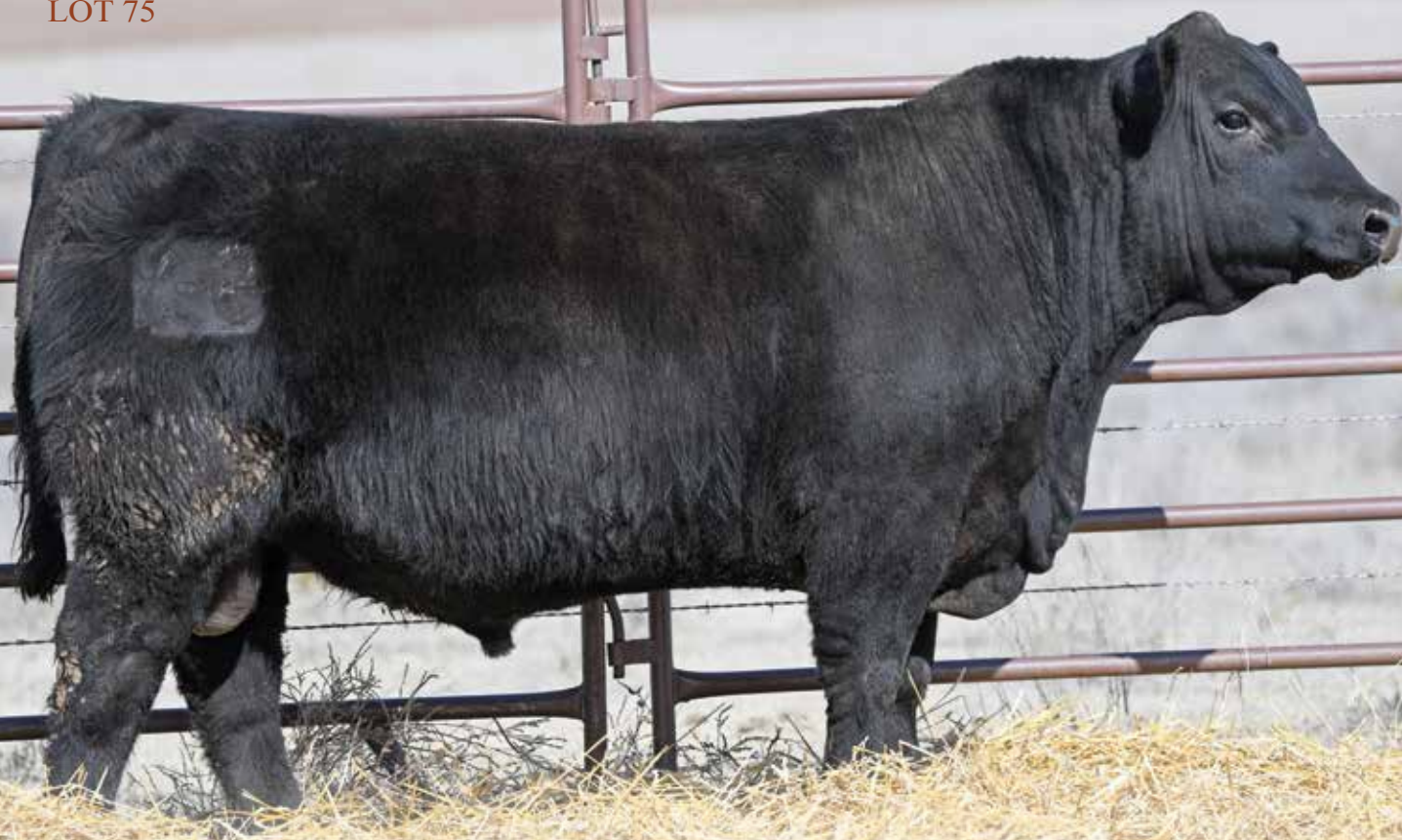
Red Lazy MC Spyder 149A - Sire of Lots 75 - 76