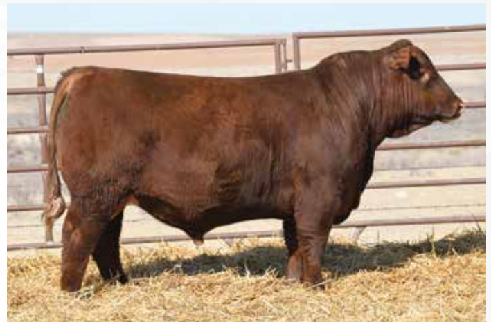
Smoky Y Born Ready 7161E - Maternal Brother to Lot 47!

Renown 8114F is another top Renown son that is from a PIE Right Kind 3120 daughter that is a promising young female with exceptional fleshing ability, udder quality, and foot structure. He is among the top 23% for GridMaster, top 17% WW, top 26% YW, and top 14% ME. He is an impressive performance oriented bull with a WW Ratio of 101 and is the premier IMF sire in the offering with an impressive 135 IMF Ratio, along with a standout REA Ratio of 109. A truly elite carcass sire that is from the Renown sire group!