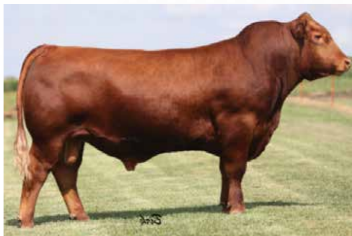
Bar-E-L Concept 49C - Sire of Lots 1 - 3