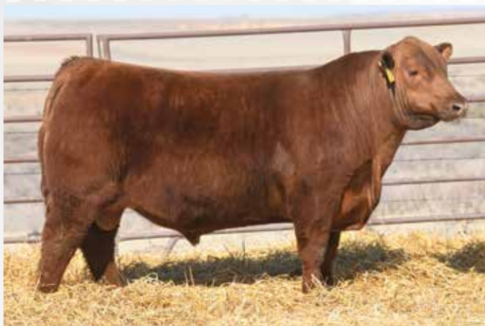
Smoky Y Now or Never 7139E - Maternal Brother to Lot 6