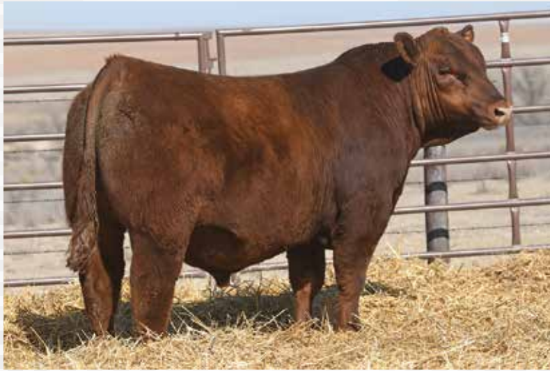
SMOKY Y RTG 7113E - Maternal Brother to Lot 77