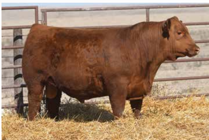
Smoky Y Sub Zero 7169 - Maternal Brother to Lot 9

Smoky Y Hallucination 8197F is another top herd sire prospect by AHL Flashback 446B and backed by the Red Geis Prime Rib 411 sired female on the bottom side of his pedigree. The dam of 8197F is Red SY Yvette 78Y, she is also the dam of the 2018 High Selling Bull, Smoky Y Now or Never that topped the 2018 sale at $16,500 to Lee's Cattle Company in Brush, Colorado. Much like his brother, Hallucination is a big centered, wide based, thick-ended herd sire prospect. He charts top 13% WW, and top 17% YW. Study the mass, dimension, and squareness of build that he possesses.