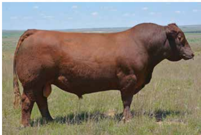
PZCTMAS Red Sky 2794 - Sire of Lots 10 - 23

RED SKY... HIS IMPACT WILL BE EVERLASTING!