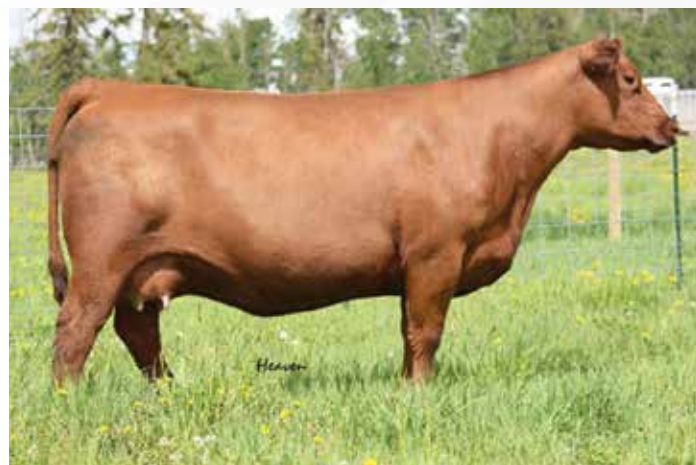
Red Rainbow Lois 7U - Dam of Lot 4

Smoky Y Dagger 8108F is a full brother to lots 12 and 13 from last year's offering. Sired by Bar-E-L Concept 49C and backed by the stunning Red Rainbow Lois 7U donor. When we first saw Lois 7U we knew she was a female that we needed to get back to the ranch due to her unparalleled presence, eye appeal, and maternal functionality. Smoky Y Dagger 8108F is one of the premier herd sire prospects produced in the class of 2019 and we believe that his strong maternal backing will aid in his success as a herd sire.