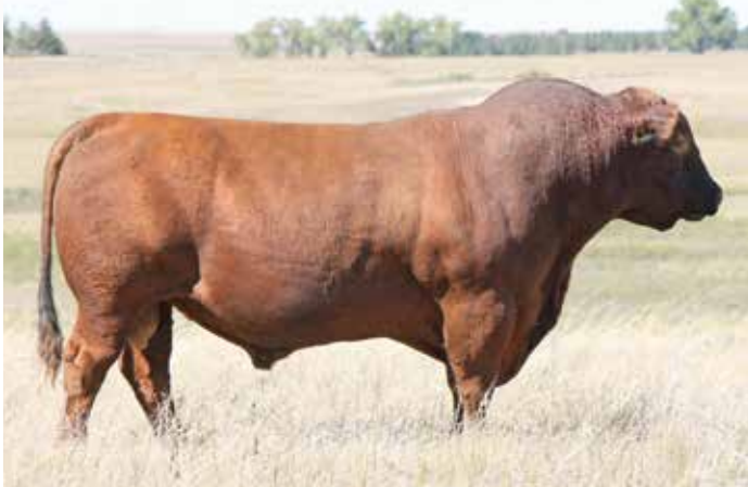
LSF Optimism 1107Y - Paternal Grand sire of Lots 73 - 74

8190F is a 3/4 brother in blood to 8194F. This pair of brothers that will add uniformity and consistency to your next calf crop. He is a top IMF herd sire prospect with an impressive 111 IMF Ratio!