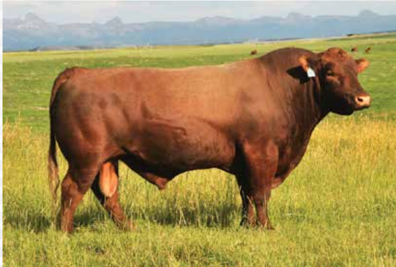
BUF CRK The Right Kind U199 - Paternal Grand sire of Lot 72