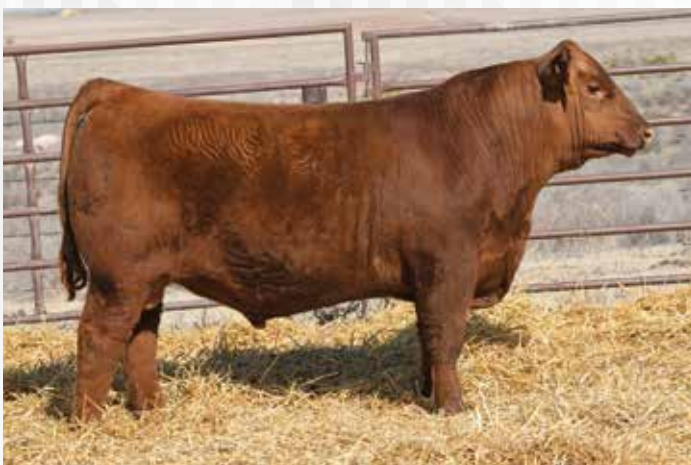
Smoky Y ProfitBuilder 7154E - Maternal Brother to Lot 49! He was selected by the Schumacher Family Trust Ranch in 2018

Smoky Y Renown 8201F is sired by Red U-2 Renown 193C and from a great producing female that is saturated with genetics from the Camp 1A program. He ranks among the top 15% of the breed for WW, top 28% YW, top 18% ME, and top 16% CW.