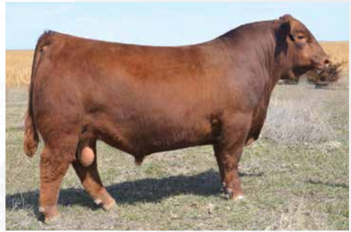
Pie One of a Kind 352 - Sire of Lots 53 - 56

8174F is another rugged, stout made PIE One Of A Kind 352 son that is from a top daughter of Wiwa Creek Rito 43'06. He is another wide based herd sire prospect that is a triple digit YW bull. He charts top 27% GridMaster, top 35% WW, top 23% YW, top 14% ADG, top 6% ME, top 22% YG, top 15% CW, and top 22% REA. A big REA bull with a REA Ratio of 106.