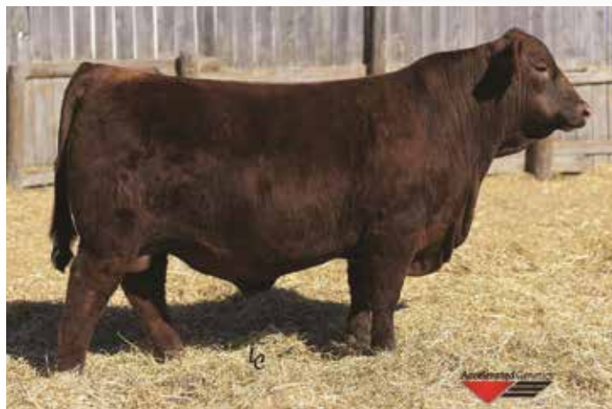
Bieber CL Atomic C218 - Sire of Lots 32 - 44

A STANDOUT SINCE BIRTH, HE CHECKS ALL THE BOXES!