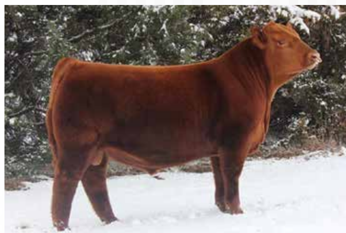
AHL Flashback 446B - Sire of Lots 5 - 9

Smoky Y Flashback 7324 is one of the premier son's in the 2019 offering by our herd sire AHL Flashback 4468. Flashback was the six-figure valued promotional sire that sold through the Western Heritage Sale on "The Hill" at the National Western Stock Show. We had the opportunity to acquire Flashback through the Englewood Farms Dispersal Sale. He has done an exceptional job for our program siring cattle with structural integrity, body mass, quality, and eye-appeal. The females sired by Flashback are some of the best replacement females that we have ever kept back and we look forward to watching the impact that they will make. 7324 ranks among the top 20% for WW, top 18% YW, top 17% ADG, top 18% ME, and top 15% Stay. A true sale feature!