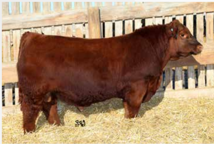
Red U-2 Renown 193C - Sire of Lots 45 - 52