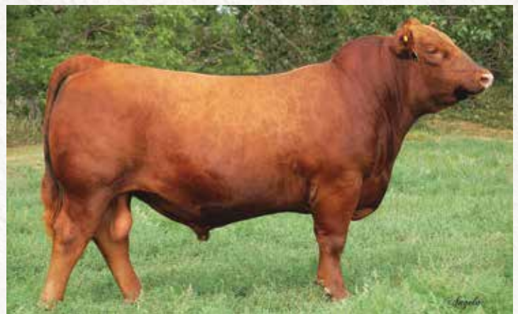
WPRA Legacy A-314 • SIRE OF LOT 56