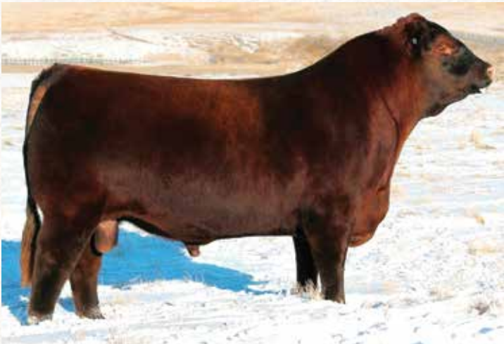
SIX MILE & CO JAGGER 780A SIRE OF LOT 55