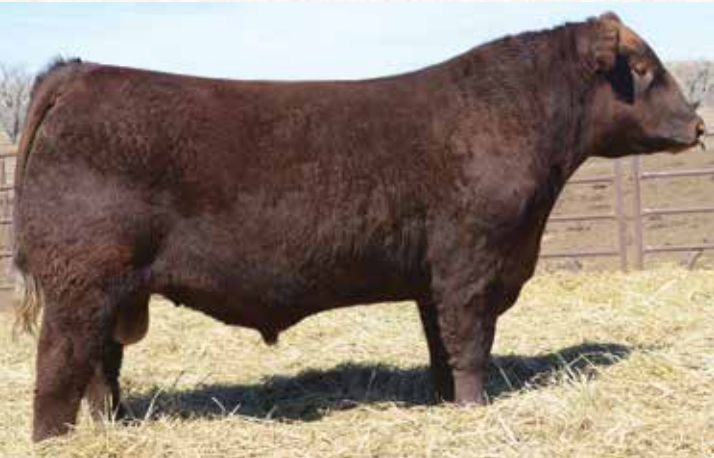
PZC TMAS RED ZONE 2795 SIRE OF LOTS 19-21