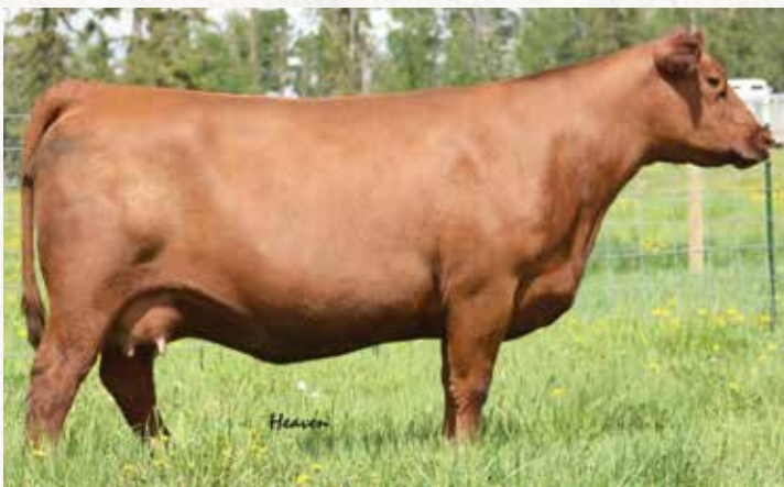
RED RAINBOW LOIS 7U • DAM OF LOT 56