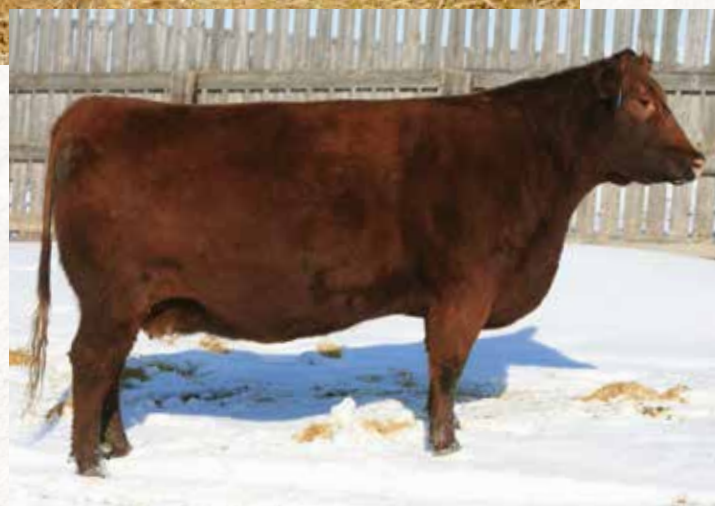
RED CRIPPS MAXINE 714T • DAM OF LOT 6

Smoky Y One Of A Kind 6161D has the added EPD profile that ranks at the very top of the breed as far as performance. A 131 for yearling weight EPD and nearly a 1,400 pound yearling weight makes him one of the real performance bulls in the offering. Decades of data collection are represented in the pedigree of this great yearling bull. His dam, Minrva, is one of the favorite females from the Windy Hill acquisition.